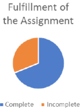
Figure 2. Fulfillment of the Assignment

As shown in the pie chart below, the majority of English language student teachers successfully completed the ten-week assignment.